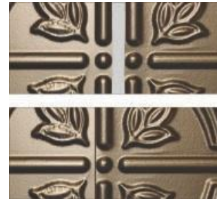
Bead + Button